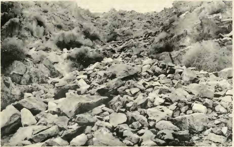
Figure 6. Inyo Mountains, Daisy Canyon. Elevation 4000 feet. Station 125. This is the most xeric environment at which a specimen of Gerrhonotus panamintinus was obtained. A large adult male was collected on June 11, 1959 in a five-quart can set out in the talus. See plate 1.